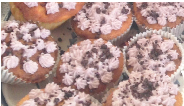
Fortius House raised £50.83 to finish fourth in the Bake Sale contest. These cakes were among the delicious treats they prepared.

Houses have also competed in a competitive Bake Sale contest that culminated in an event in the school's Long Room on Friday 29th January. The event raised a total of £308.84, with Altius house being crowned champion bakers by raising £69.25. More than 300 cakes were on sale.