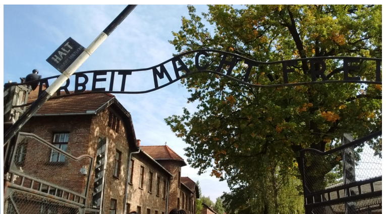
The famous entrance gate at Auschwitz during the visit.

The trip was preceded and followed by seminars where they discussed their expectations and reflected upon their experiences of the visit. As part of the project, the two have become ambassadors for the Holocaust Educational Trust.