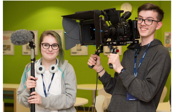
Cameras, Sound & Lighting